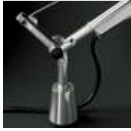
TOLOMEO SUPP.TAVOLO FISSO A004200