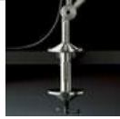
TOLOMEO MORSETTO A004100