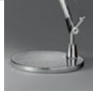
TOLOMEO BASE TV ALL D230 A004030